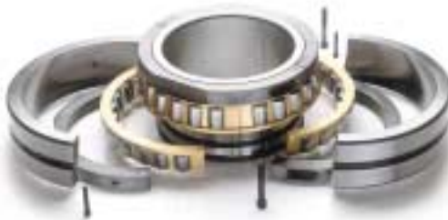
For special applications split bearings with separate split clamping rings are available