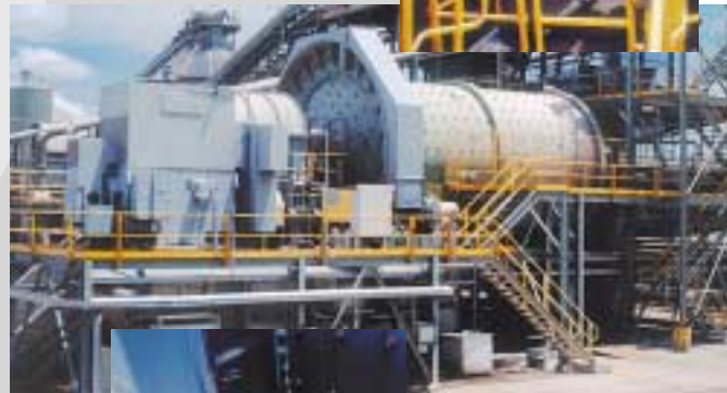
Bearing arrangements in crushers, mills and processing equipment