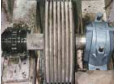
Drive bearing arrangements of conveying and transport equipment