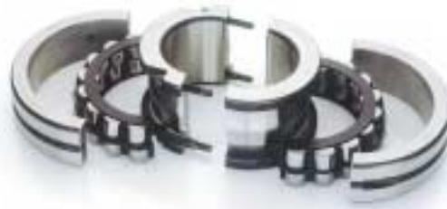
Split Spherical Roller Bearings come with glass-fibre reinforced Polyamide and Brass cages