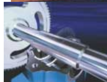
Simple Dismounting and Mounting lead to enormous cost reduction.